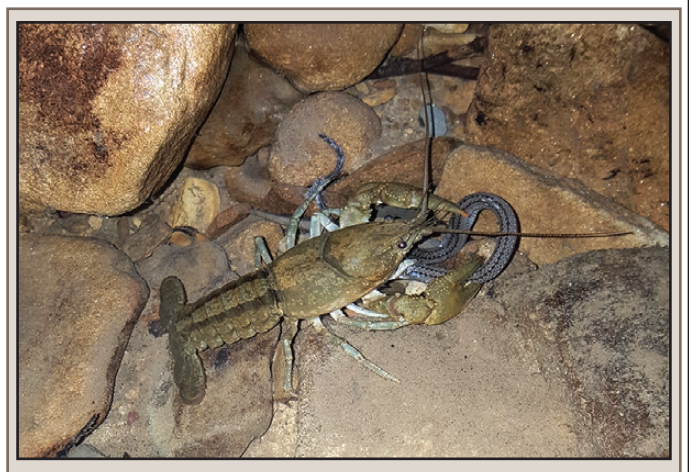
FIG. 2. Faxonius cristavarius feeding on a Storeria occipitomaculata after release.

This is the first documented observation of active predation on either D. punctatus or S. occipitomaculata by a crayfish. At 0210 h, on 14 July 2018 on University of Kentucky's Robinson Forest in Knott County, Kentucky, USA (37.4639°N, 83.1193°W; NAD 83), one of us captured an adult D. punctatus within the riparian zone of an intermittent stream. The captured snake was rinsed in a stream to remove musk and subsequently attacked by an F. cristavarius. Although we removed the crayfish from the D. punctatus, we noticed that the crayfish was actively searching in the stream for the snake. Shortly after the predation attempt, we observed a second F. cristavarius feeding on a S. occipitomaculata at 0220 h (Figs. 1, 2). The F. cristavarius was captured and photographed, yet it did not release the prey item. These events suggest that E cristavarius , and likely all larger stream dwelling crayfish, actively prey upon small woodland snake species (as well as small aquatic snakes; Ernst and Ernst 2003, op. cit.) when they enter aquatic environments.