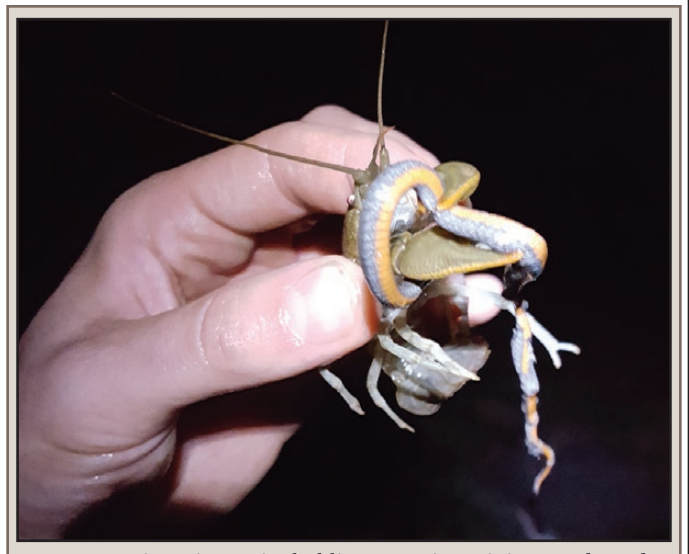
FIG. 1. Faxonius cristavarius holding Storeria occipitomaculata after being captured.

DIADOPHIS PUNCTATUS (Ring-necked Snake) and STORE-RIA OCCIPITOMACULATA (Red-bellied Snake). PREDATION. Small woodland snakes are commonly predated by invertebrates (Ernst and Ernst 2003. Snakes of the United States and Canada. Smithsonian Books, Washington, D.C. 668 pp.). Here, we provide observations of two woodland snake species, Diado phis punctatus and Storeria occipitomaculata , being attacked or preved upon by Faxonius cristavarius (Spiny Stream Crayfish).