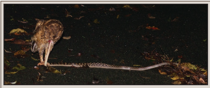
FIG. 1. Predation of Hebius pryeri by Otus semitorques pryeri.

The diet of O. s. pryeri consists mainly of insects, noninsect invertebrates, and reptiles, including snakes (Toyama and Saitoh 2011. J. Raptor Res. 45:79–87). However, there is no detailed description which snake species are consumed or the owls' predatory behavior. My observation revealed that the owl uses H. pryeri as a food resource, but it is unknown whether the snake was alive or dead when the owl captured it. There are snakes smaller than H. pryeri inhabiting the Ryukyu Archipelago, which may be preved upon by owls. Further